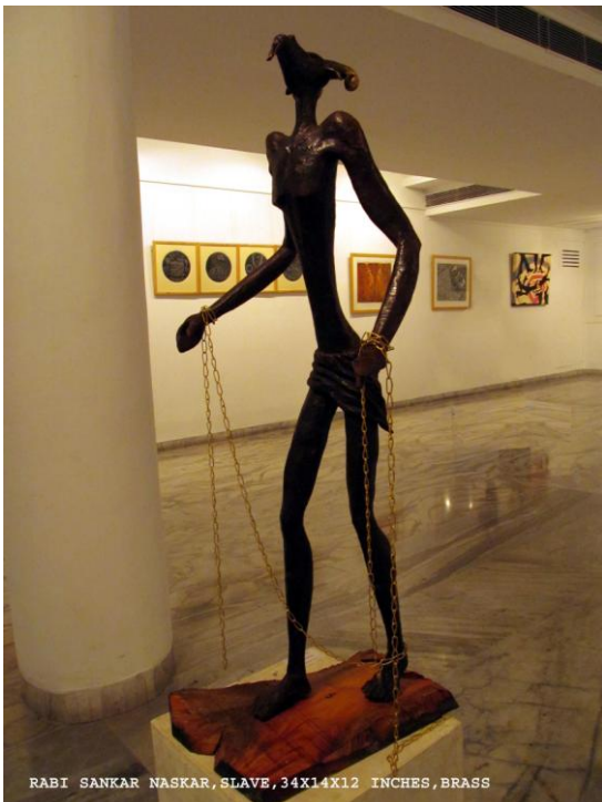
RABI SANKAR NASKAR, SLAVE, 34X14X12 INCHES, BRASS